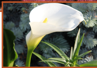
Nature knows how to be its best self, year after year.