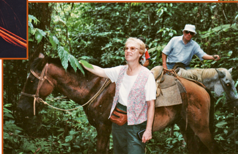
Travelling in Costa Rica.