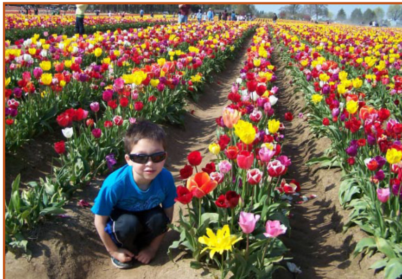
Wooden Shoe Tulip Festival, Woodburn... or "force field" for good.

"What do you mean?" "Well they aren't even here and you are afraid of them." "Let's not think about them unless we actually see one. Let's think about something else." "Like what?" he asked. "How about the thousands of tulips you saw last week in Woodburn." I know that was a grandma thing to say but he bought it. We also came to the conclusion that when he got older he would invent a force field to keep the bad guys out. He turned over and went to sleep thinking of tulips and force fields.