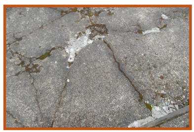
Living with the cracks, holes and lousy patch jobs.

In the past I had gotten bids on replacing it and