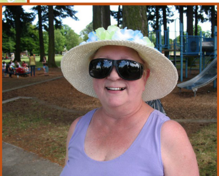
Setting up at the Community picnic.

community of people who are seeking their own Truth and giving her space to find hers.