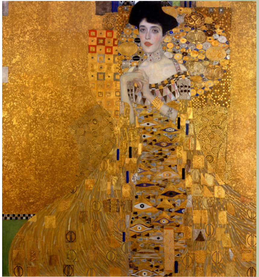
The Woman In Gold, Gustav Klimt

HAVEN'T WE ALL HAD PRECIOUS TIME STOLEN FROM US?