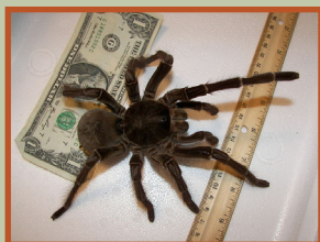
A Goliath birdeater spider ( Theraphosa blondi ) with a 12-inch ruler and a dollar bill for scale.

From the back seat I heard him say quietly, "I am confident." In the front seat I was thinking the same thing.