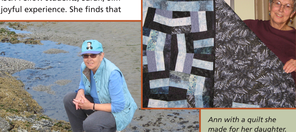
made for her daughter.

At Yachats on a coast vacation last fall.