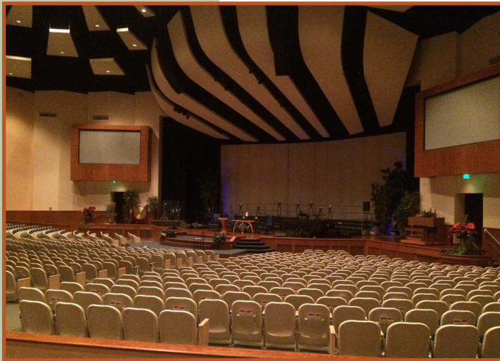
A view from the back of the sanctuary at "Mile Hi."

As a reminder, here's our Purpose, Vision and Mission: