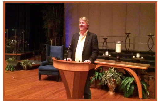
Just practicing at Mile Hi Church in Denver.

When a group of people has a clear mission and vision and can see that progress is being made, the support flows more easily! To this end, we will make some changes at Portland Center for Spiritual Living. We will provide a mission-based budget for this coming year that will include the numbers but will highlight how we're changing lives. A full set of financials will be available to those who wish to see it.