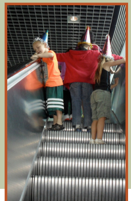
AUGUST – Field trip to OMSI builds a strong sense of community in youth church membership. Discussions about the natural laws of nature and God will follow.