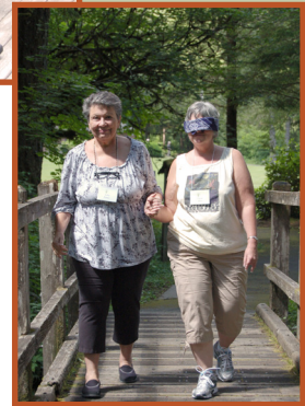
JUNE – Happy campers at annual “Spirit As Woman” retreat at Silver Falls, Silverton.