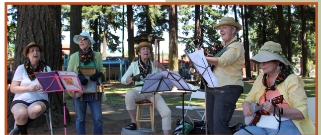
JULY – Community picnic at Peninsula Park; entertainment by the Pickled Peppers Band.