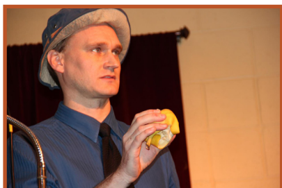
PHOTO GALLERY PCSL STARLIGHT TALENT SHOW