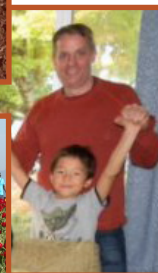
Son and grandson.