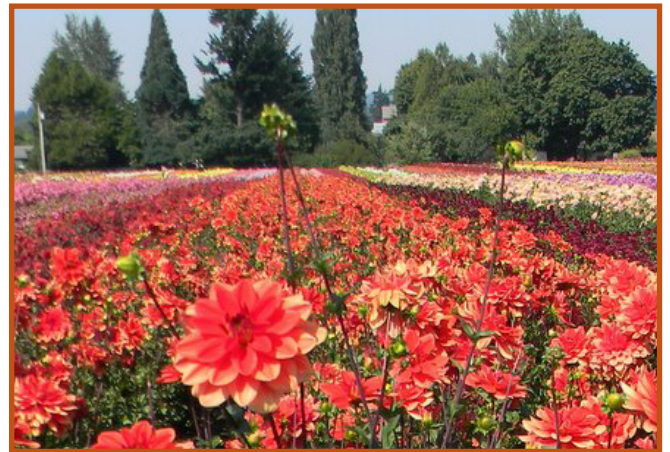
The Dahlia Festival – one of many things contributing to my experience of abundance.

As Emma Curtis Hopkins was fond of saying, "my good is my God." I think PCSL is my good, how about you?